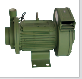
Cabin Crew Ventilation Fan Engine Compartment Ventilation Fan Turret Smoke Extraction Fan Air Filter Scavenge Fan