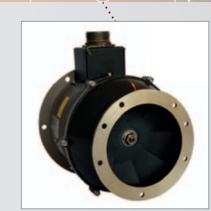
Oven Fan Avionic Cooling Fan